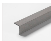
'L' Shape Trim